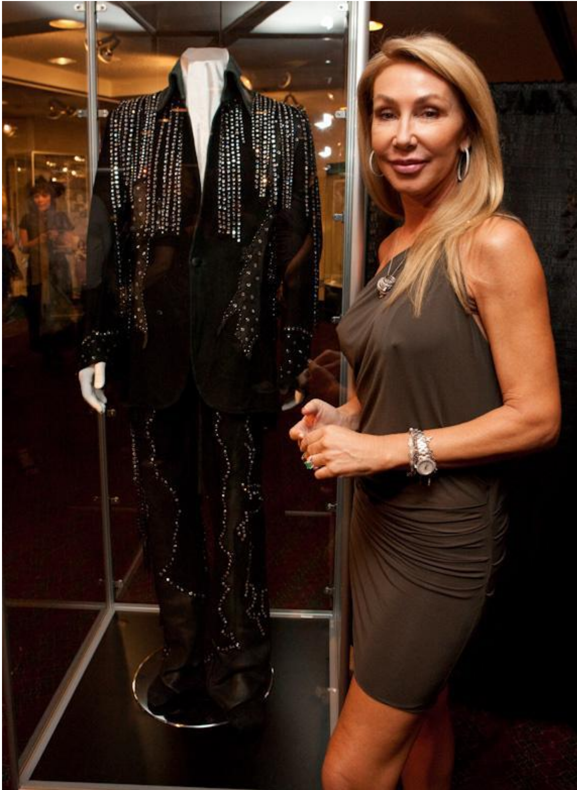
Linda Thompson (Elvis's former girlfriend & Brody Jenner's Mother) by a suit she had deigned for Elvis (apprx. 1974) to match one of her own