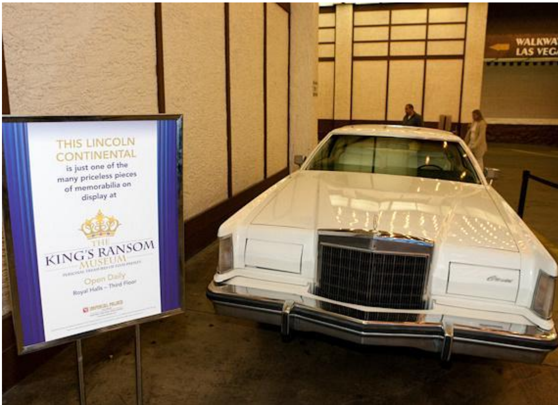
Elvis' 1977 Lincoln Continental

The King's Ransom Museum is located in the Imperial Palace's Royal Halls, on the third floor of the casino. The exhibit is open seven days a week from 11:00 a.m. to 7:00 p.m. and admission is $12. Tickets may be purchased at the door or online at www.imperialpalace.com . The King's Ransom Museum is scheduled to remain at Imperial Palace until July 2010. For more information, visit www.imperialpalace.com , www.thekingsransom.com or call 1-888-777-7664.