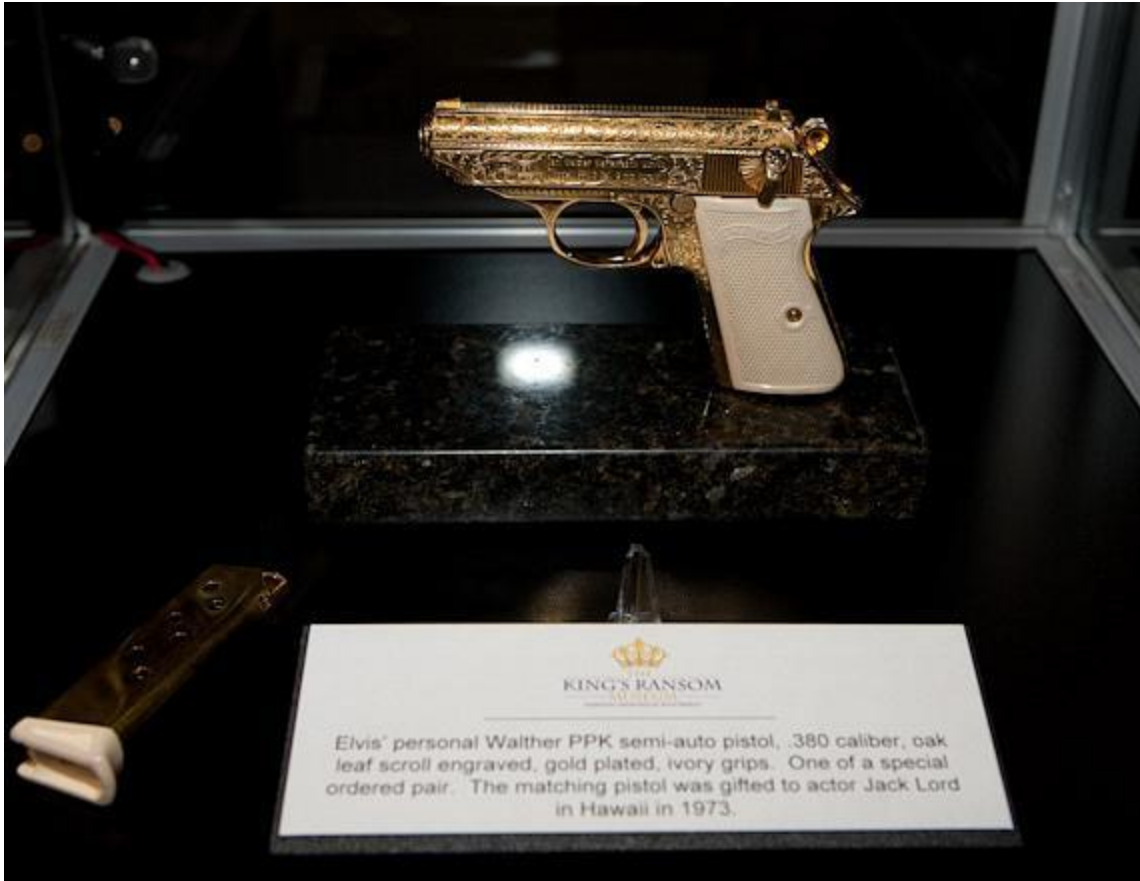
Elvis' personal gold-plated Walther PPK pistol